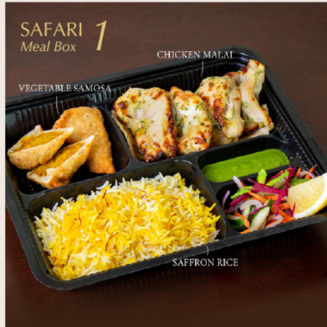
Vegetable Samosa ซาโมซาผัก Chicken Malai ไก่มาลัย Saffron Rice ข้าวซีฟรอน