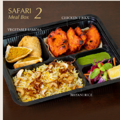
Vegetable Samosa ซาโมซาผัก Chicken Tikka ไก่ติ๊ก้า Biryani Rice ข้าวหมกบรียานี