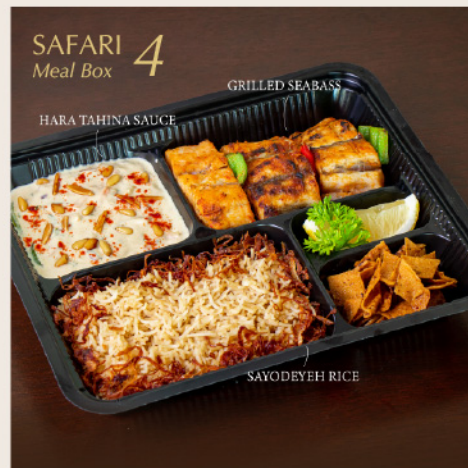
Tahini Sauce ซอสงาขาว Grilled Seabass ปลากระพงย่างสไตล์เลบานอน Sayodeyh Rice ข้าวเขยาดีห์