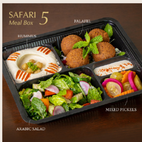
Tahini Sauce ซอสงาขาว Grilled Seabass ปลากระพงย่างสไตล์เลบานอน Sayodeyh Rice ข้าวเขยาดีห์