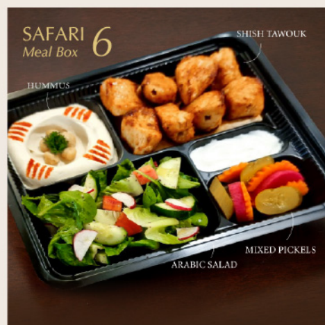
Hummus ฮัมมุส Shish Tawouk ออไก่หมักย่างสไตล์เลบานอน Arabic Salad สลัดสไตล์อาหรับ Mixed Pickles ผักดองรวม