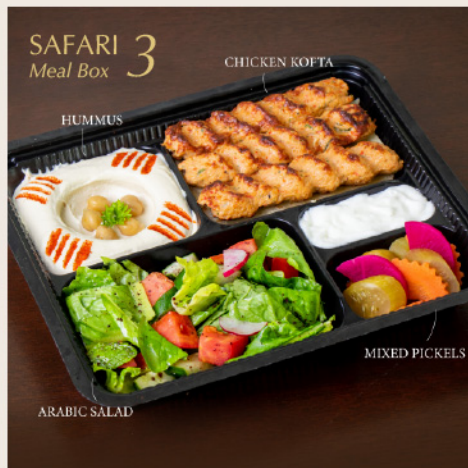
Hummus ฮัมมุส Arabic Salad สลัดสไตล์อาหรับ Mixed Pickles ผักดองรวม